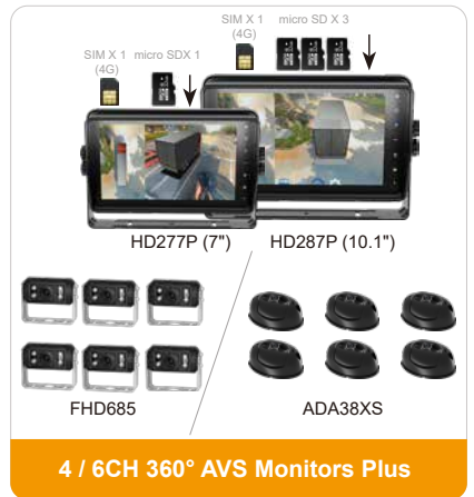
4 / 6CH 360° AVS Monitors Plus