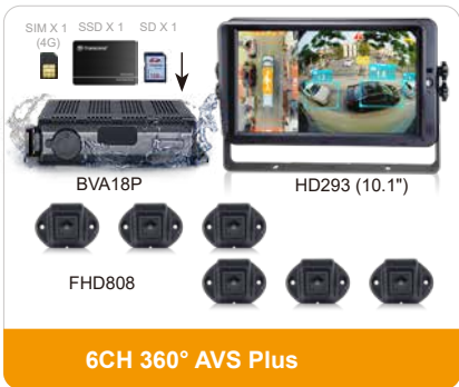
6CH 360° AVS Plus