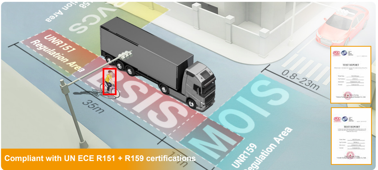
Compliant with UN ECE R151 + R159 certifications