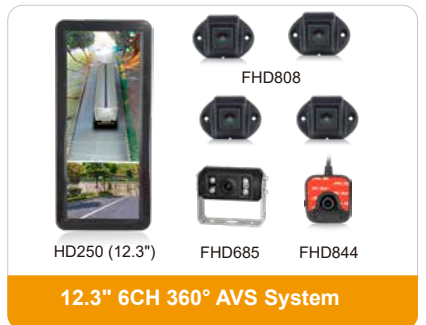
12.3" 6CH 360° AVS System