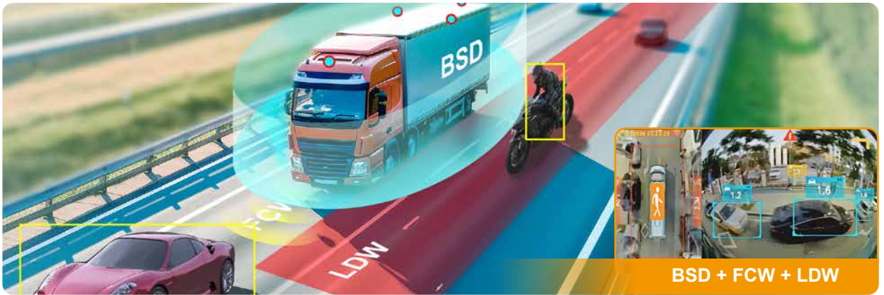
BSD + FCW + LDW