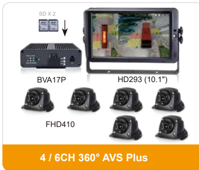
4 / 6CH 360° AVS Plus